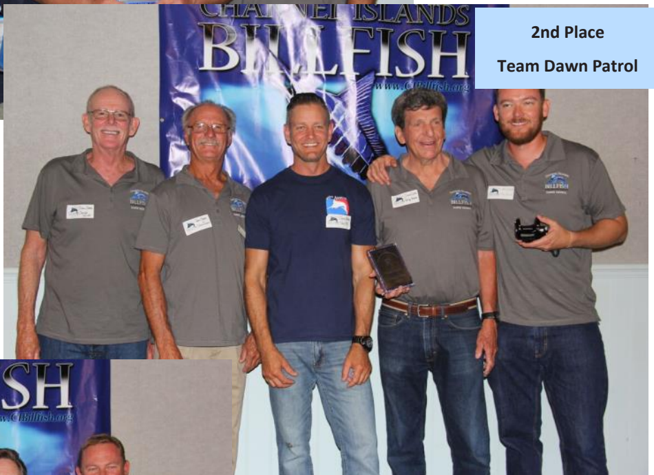
2nd Place Team Dawn Patrol