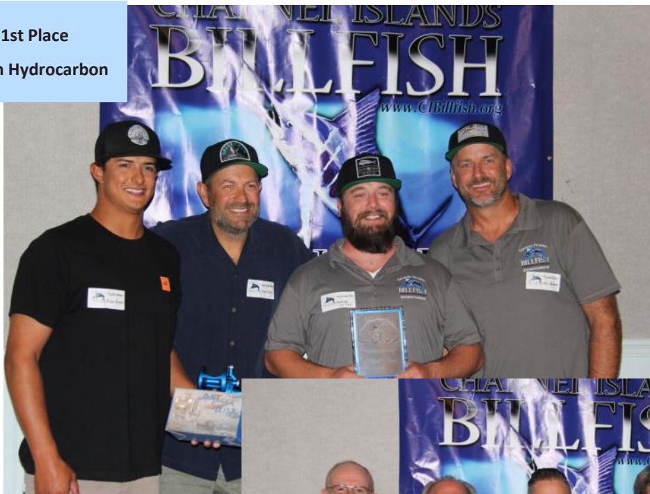
1st Place Team Hydrocarbon