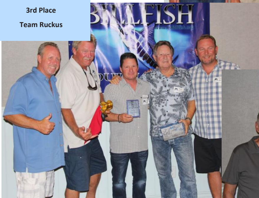
3rd Place Team Ruckus