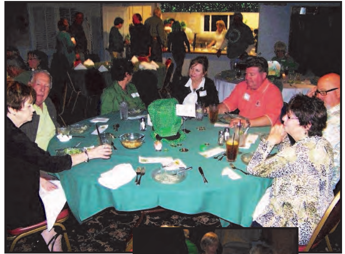
St. Pat Social March 16th