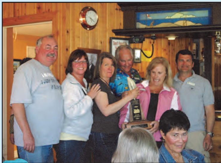
2013 WINNERS OF THE WHALE WATCH CONTEST