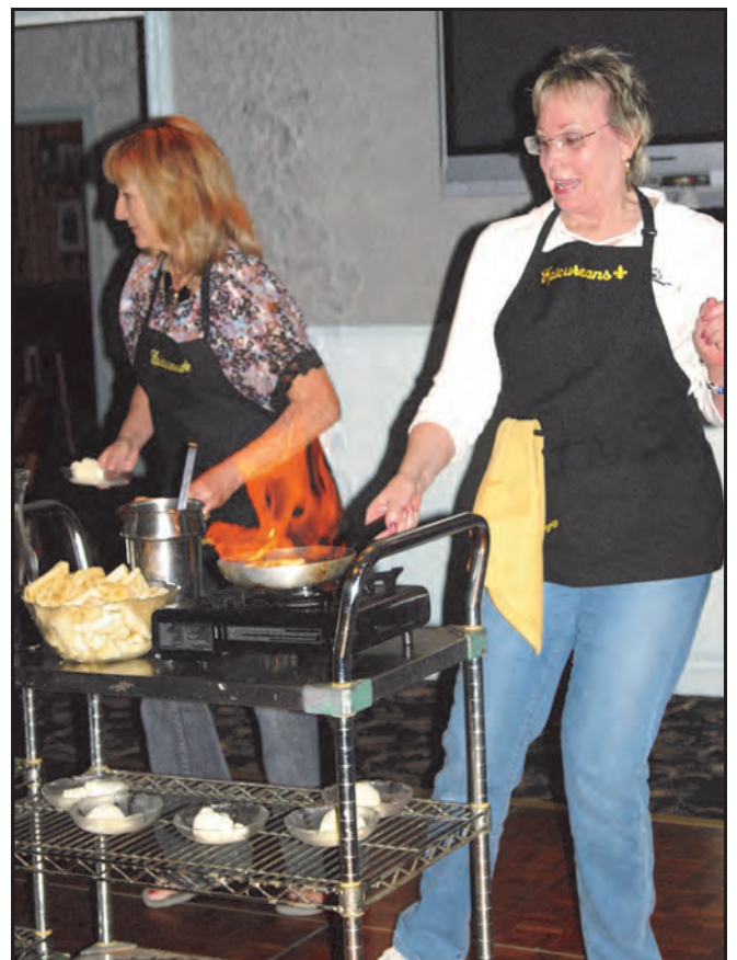
Epicureans Dinner & Wine Tasting March 23