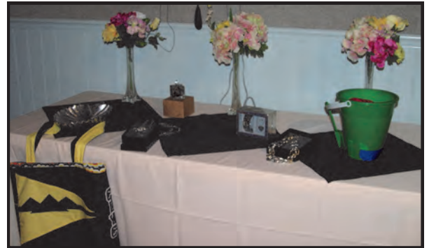
Channel Islanders Anniversary Dinner March 21st