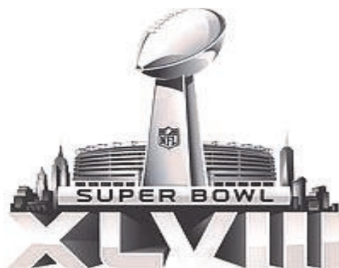
TABLE GATE CHALLENGE SUPER BOWL SUNDAY FEB. 2, 2014 1PM UNTILL...

The following teams will be contending for the, Best Food and Best Decoration awards: