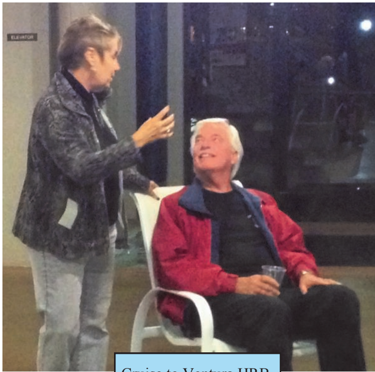
Cruise to Ventura HRB. Nov. 23rd & 24th