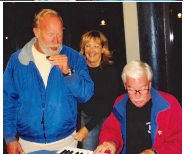
Cruise to Ventura HRB. Nov. 23rd & 24th