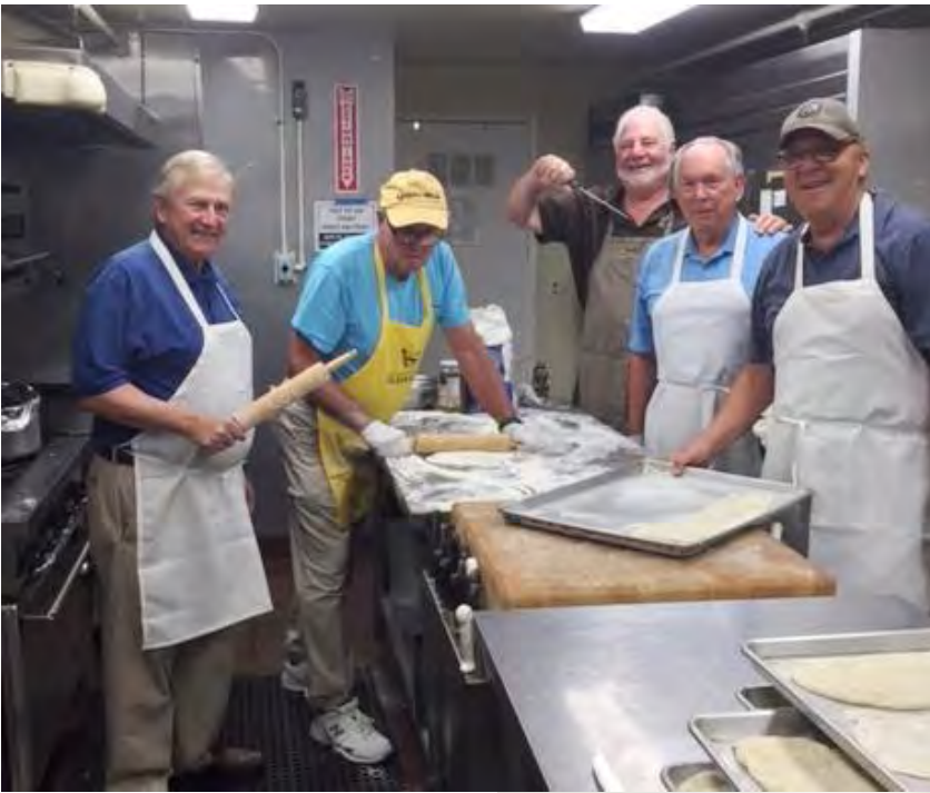
Mothers Day Luncheon May 14 th