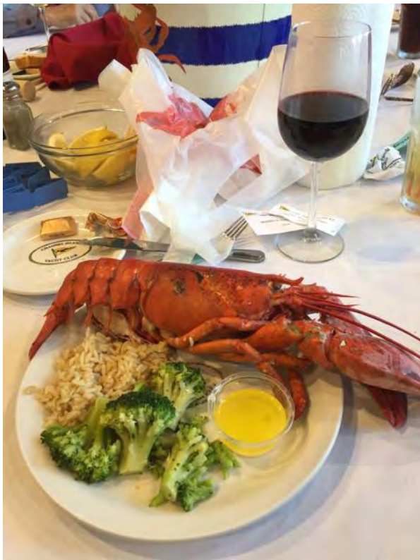
Anglers Lobster Dinner May 20 th