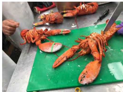
Anglers Lobster Dinner May 20 th