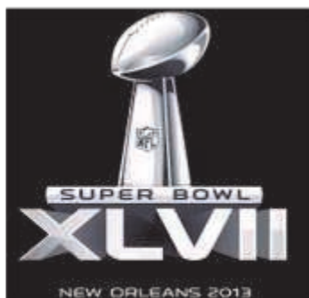
TABLE GATE CHALLENGE SUPER BOWL SUNDAY FEB.3, 2013

The following teams will be contending for the, Best Food and Best Decoration awards: