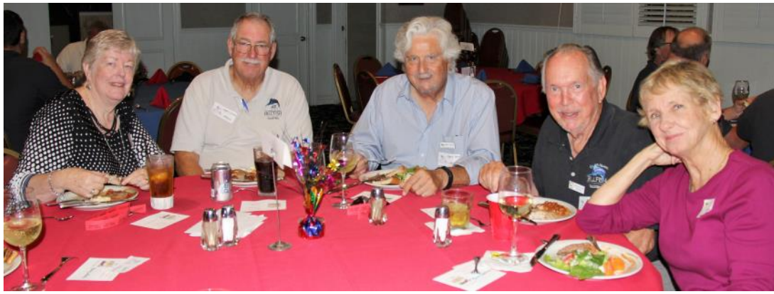
CIBFT Awards Dinner by Islanders September 14 th