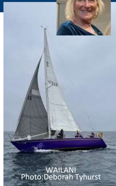
WAILANI