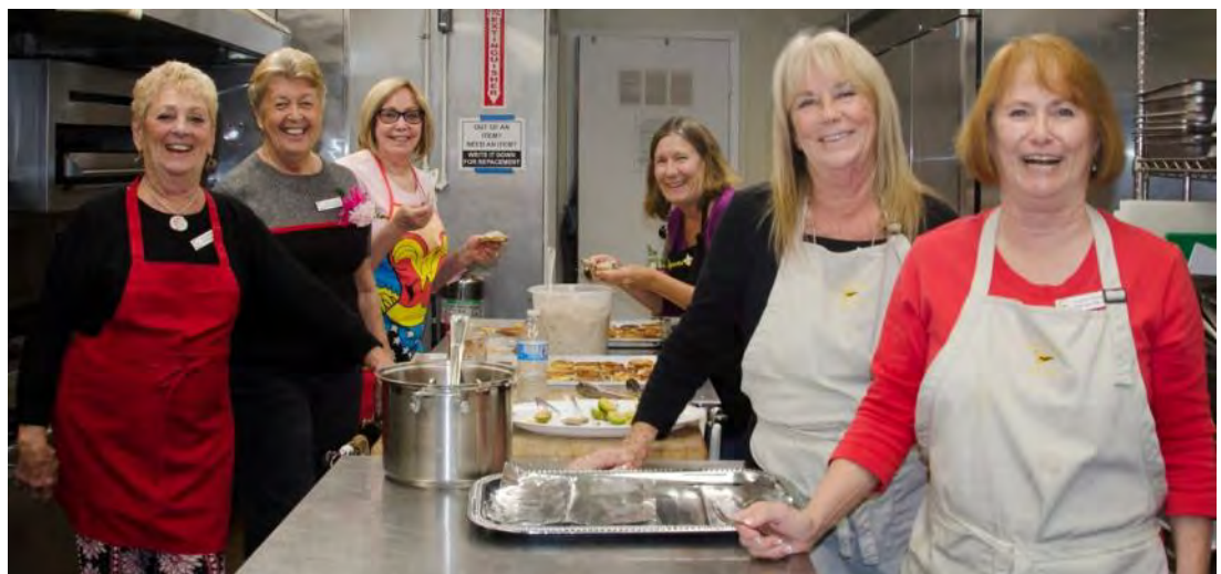
Valentines Dinner Social Epicureans February 09<sup>th</sup>