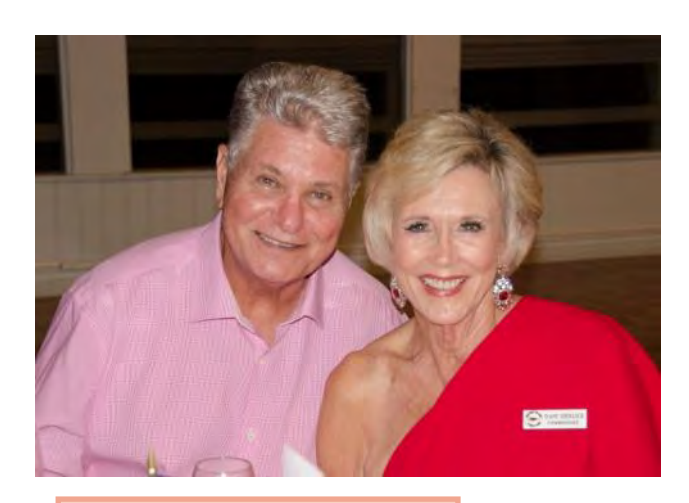
Valentines Dinner Social Epicureans February 09<sup>th</sup>