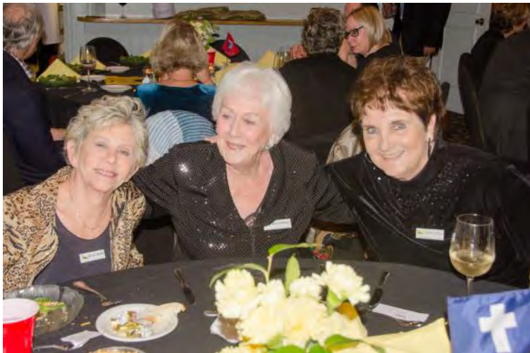
Change of Watch January 12 th