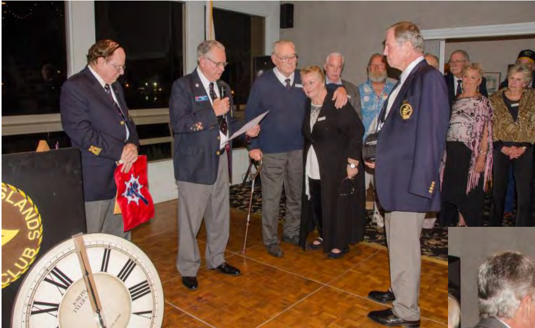
Change of Watch January 12 th