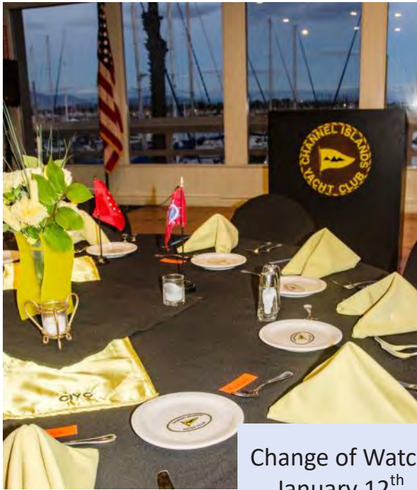
Change of Watch January 12 th