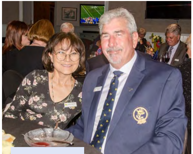
Change of Watch January 12 th