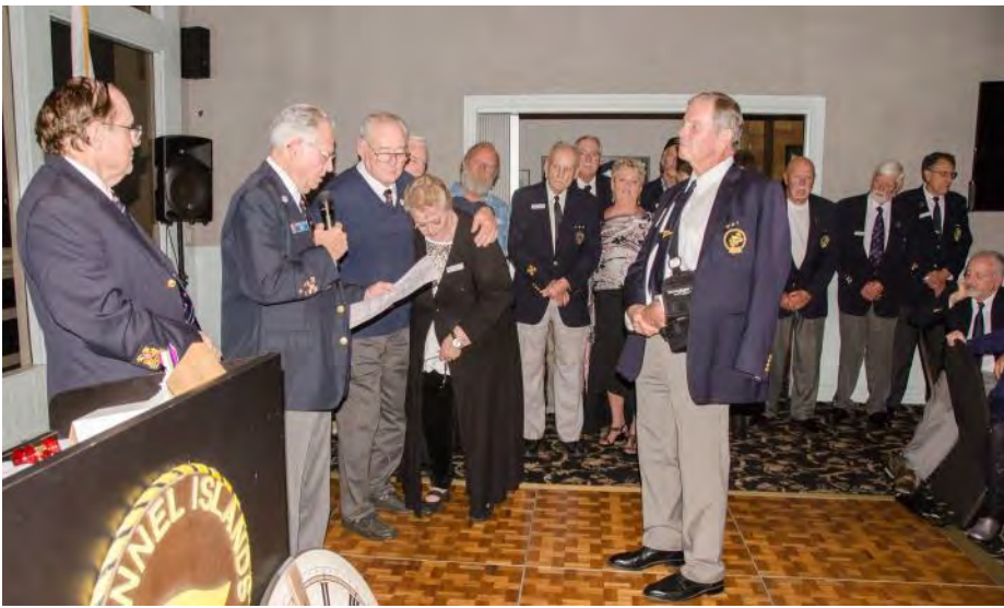
Change of Watch January 12 th