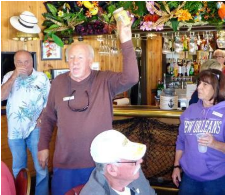
Electric Boat Event April 28 th