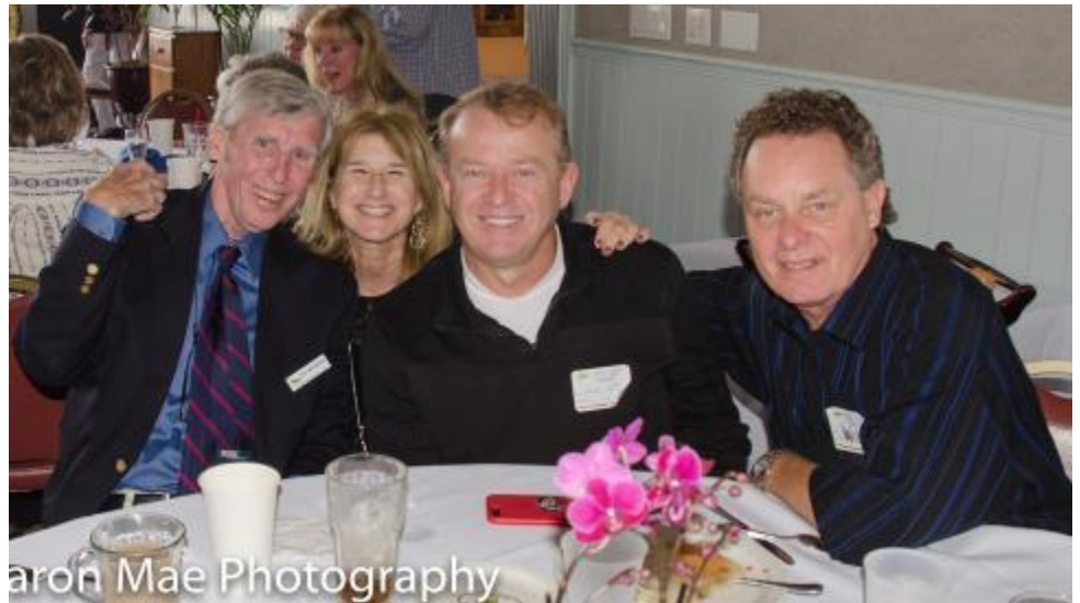
Sharon Mae Photography