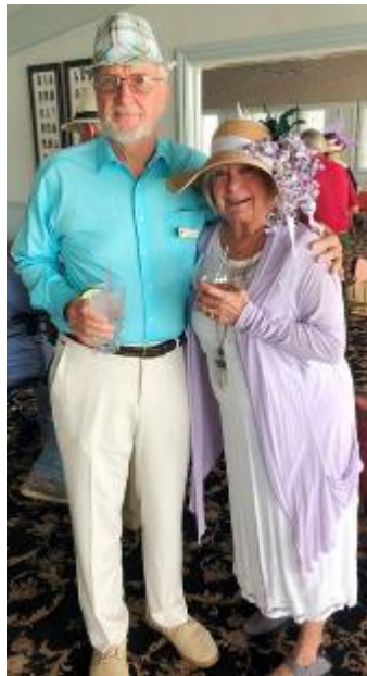
Derby Day May 4 th