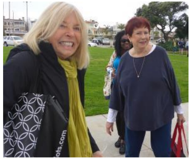
Electric Boat Event April 28 th