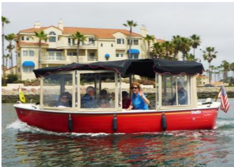
Electric Boat Event April 28 th