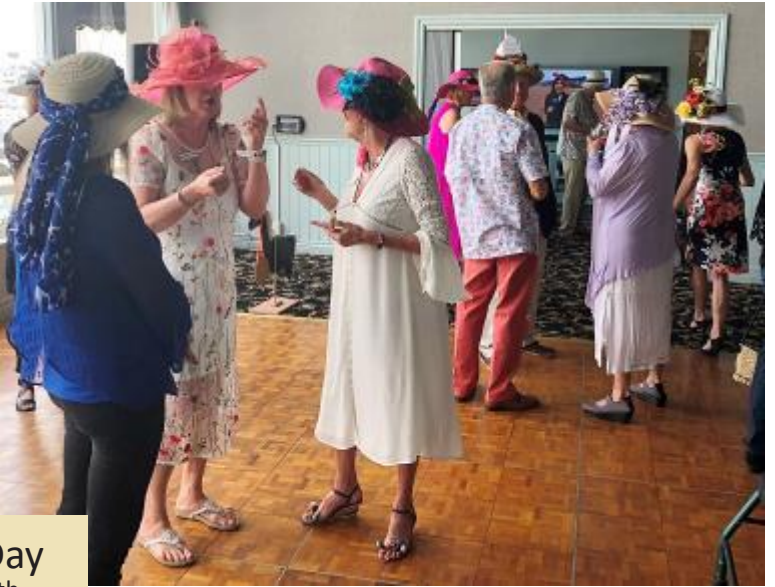
Derby Day May 4 th