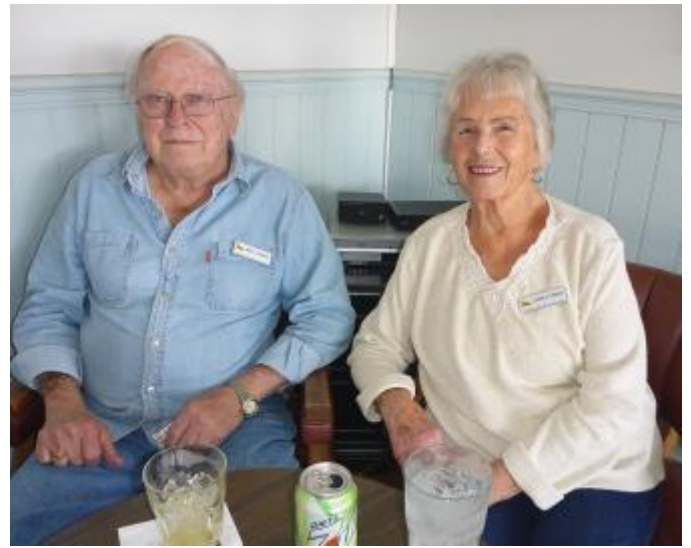
Electric Boat Event April 28 th