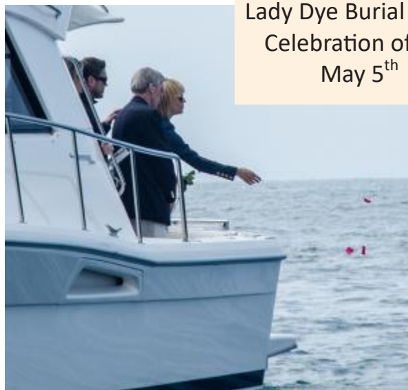
Lady Dye Burial at Sea Celebration of Life May 5 th