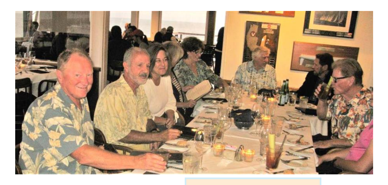
Cruise to Santa Barbara Oct. 12th -14th