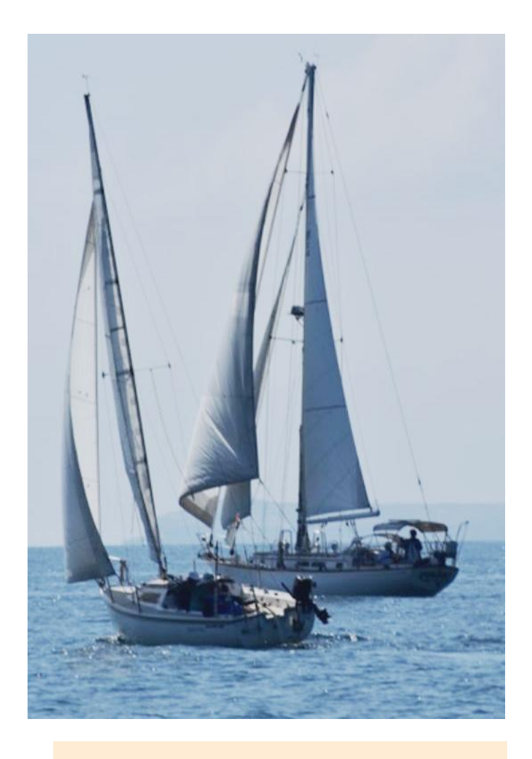
DESERT WIND (L) and JULIET (R) in the NonSpinnaker fleet, heading to Platform Gina