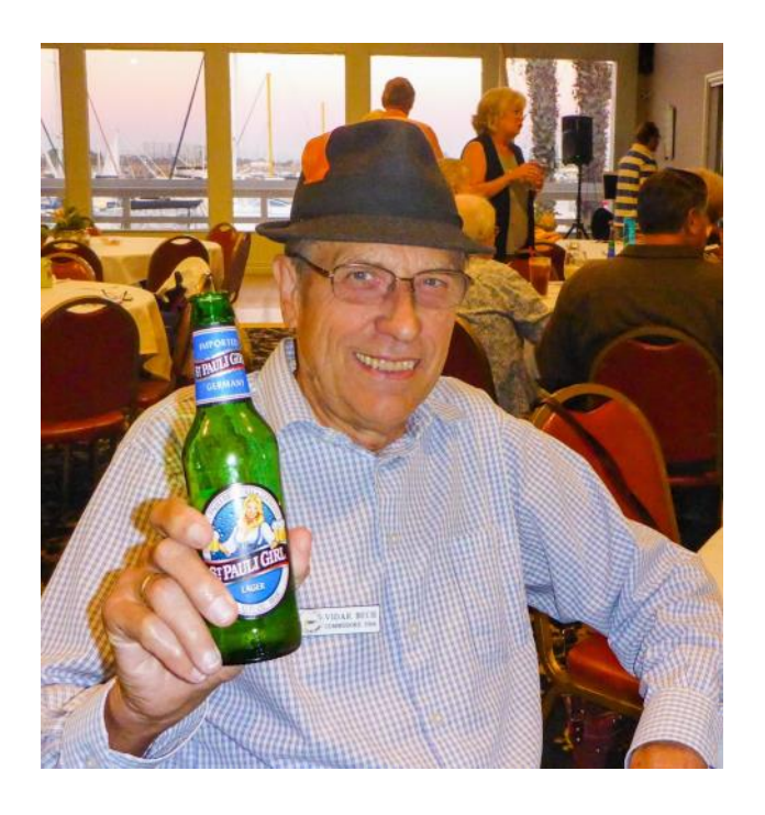
Octoberfest Party October 17<sup>th</sup>