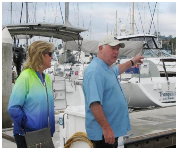
Cruise to Santa Barbara Oct. 12th -14th