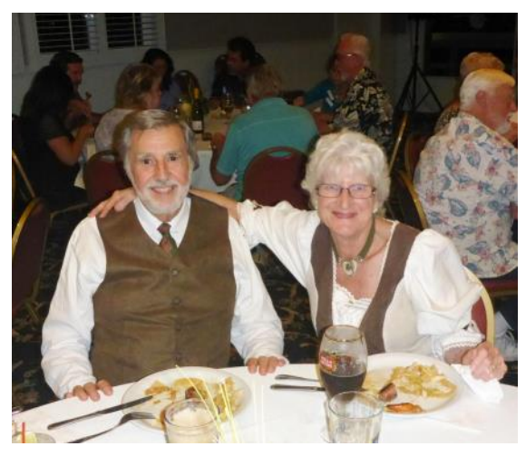
Octoberfest Party October 17<sup>th</sup>