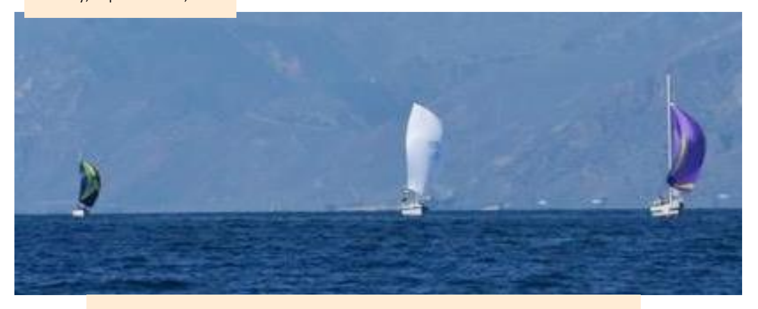
Spinnaker run back to Channel Islands Harbor - JEDI (Left), ZOARCES (Middle), and WAI'LANI (Right)