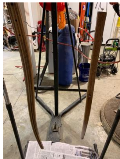
HOT LIPS' companionway board saved with epoxy and ready for paint!

I don't know who or what yet and it will be old news next month. Nonetheless, thank you, all, for your time and efforts on the boats and in the CIYC