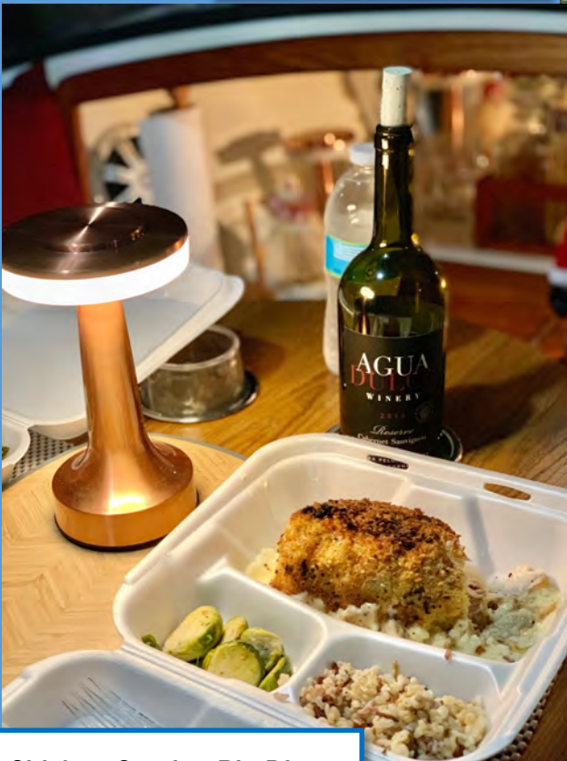
Chicken Condon Blu Dinner prepared by our crew