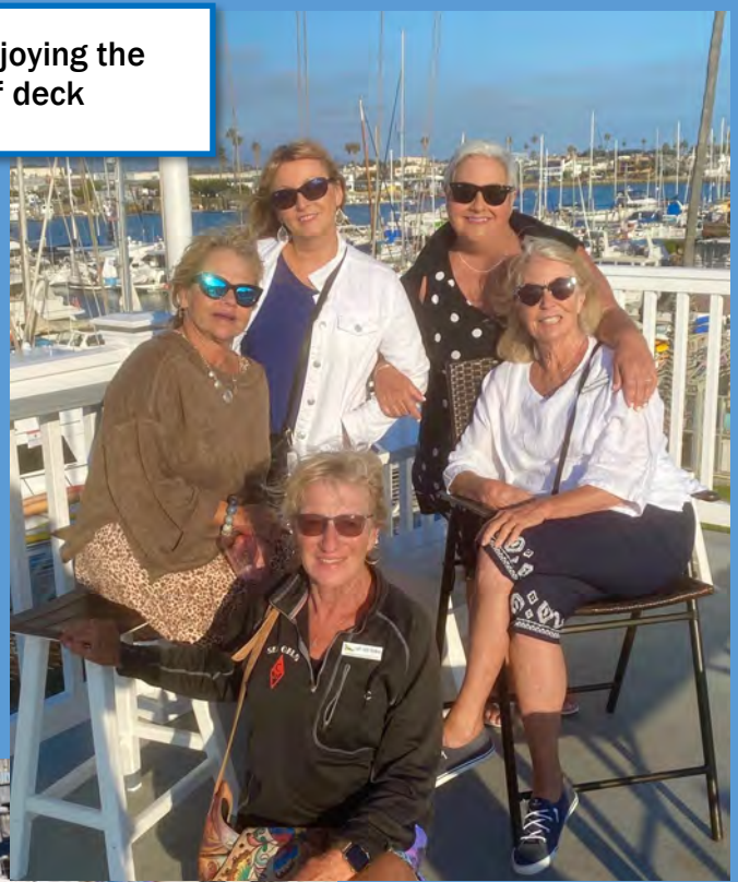
Members enjoying the new roof deck