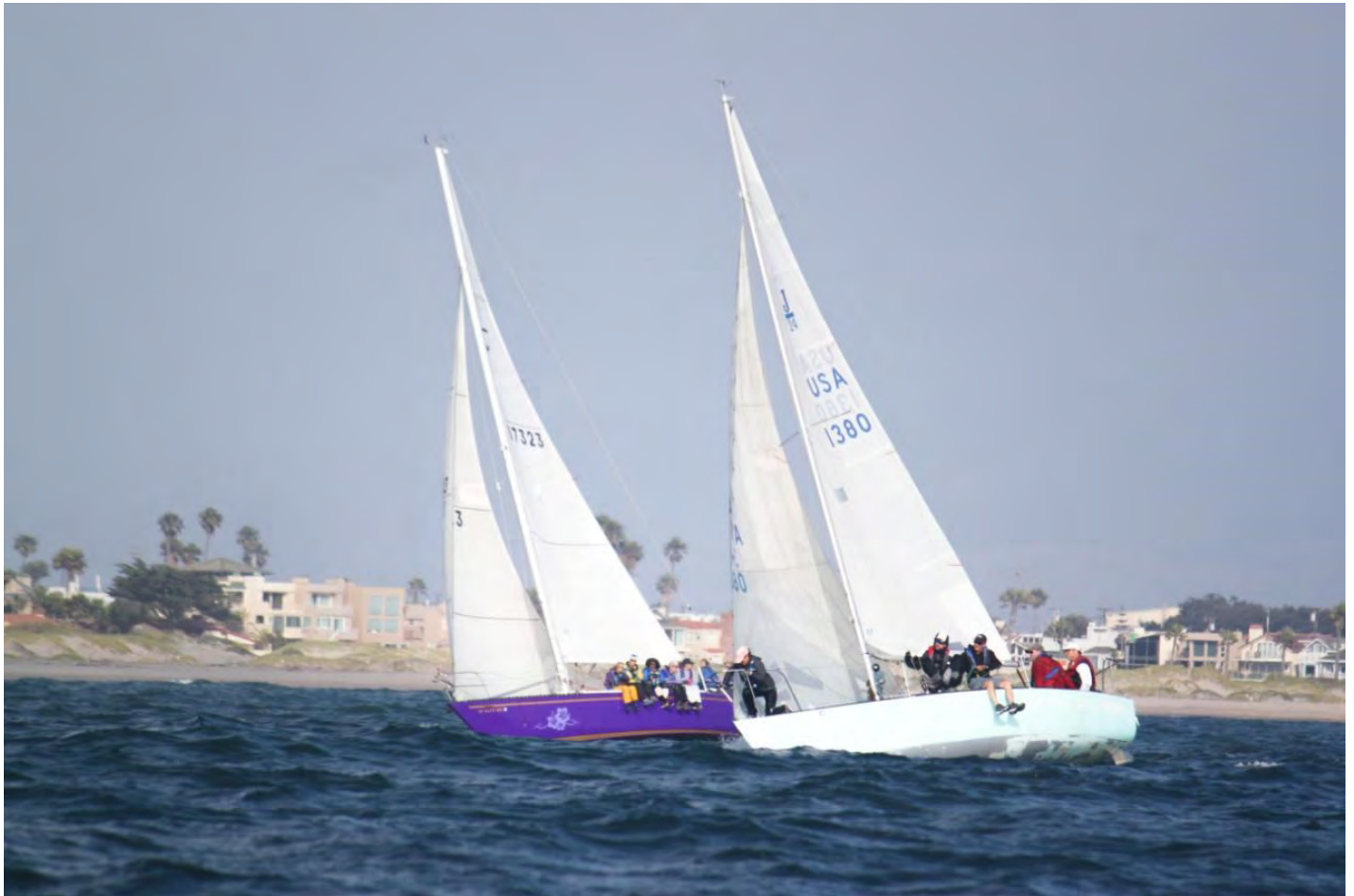
Sail Racers