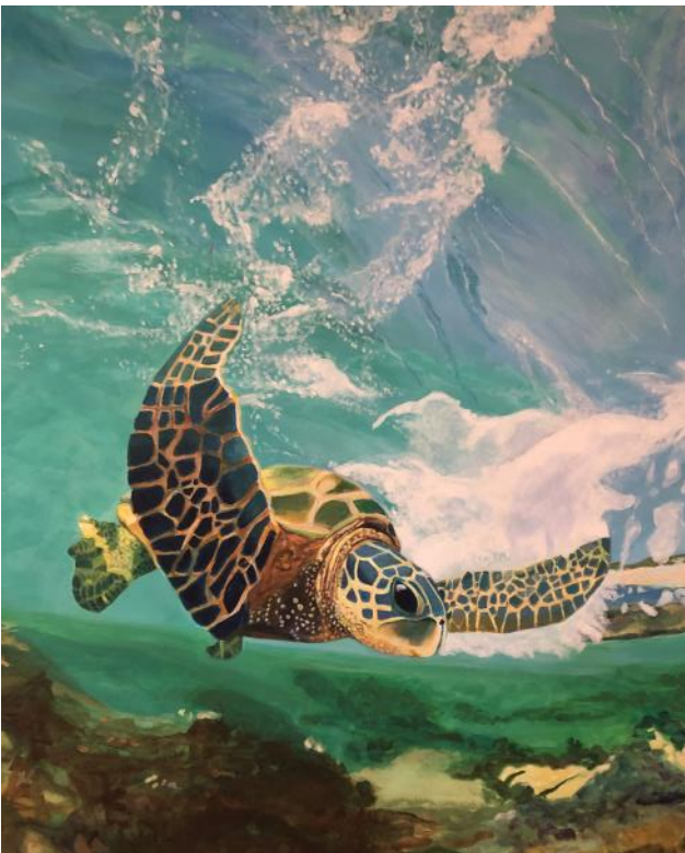
Evelina painted this after a magazine cover she saw and liked in Hawaii.