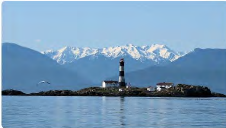
Race Rock & The Olympic Mts