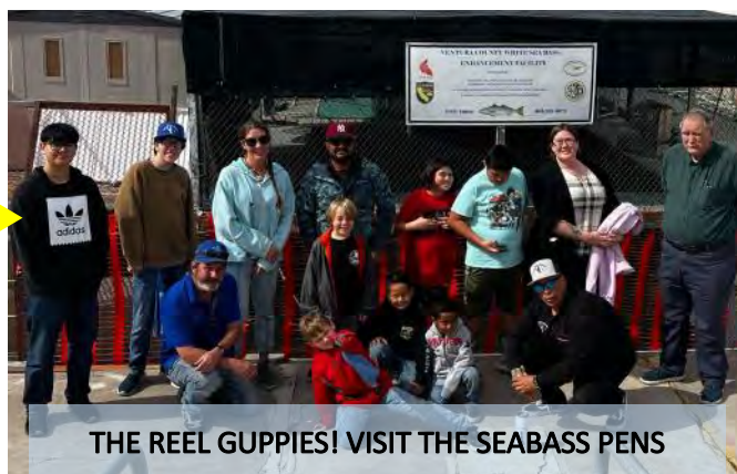
THE REEL GUPIES! VISIT THE SEABASS PENS