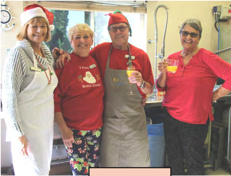
Jingle Bell Brunch December 15 th