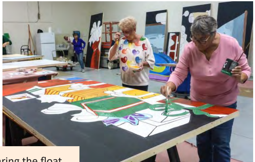
Preparing the float