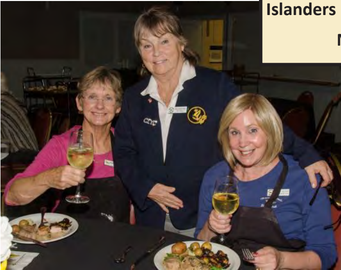
Islanders Election Meeting Nov. 07 th