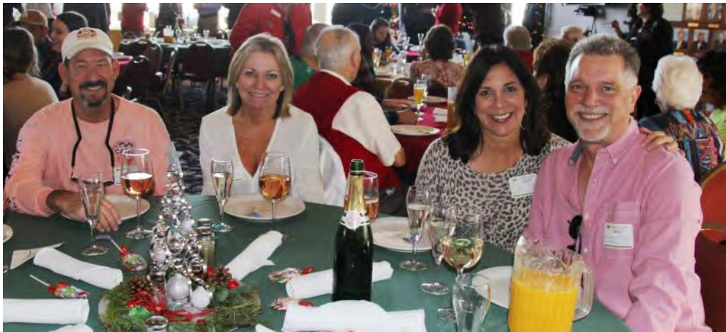
Jingle Bell Brunch December 15 th