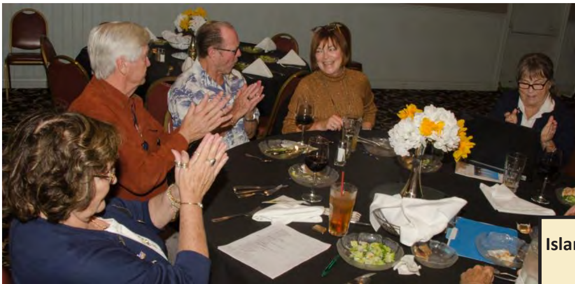
Islanders Election Meeting Nov. 07 th