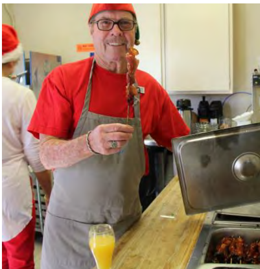
Jingle Bell Brunch December 15 th