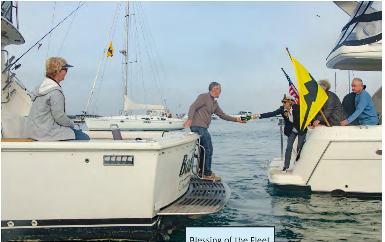
Blessing of the Fleet January 6 th .