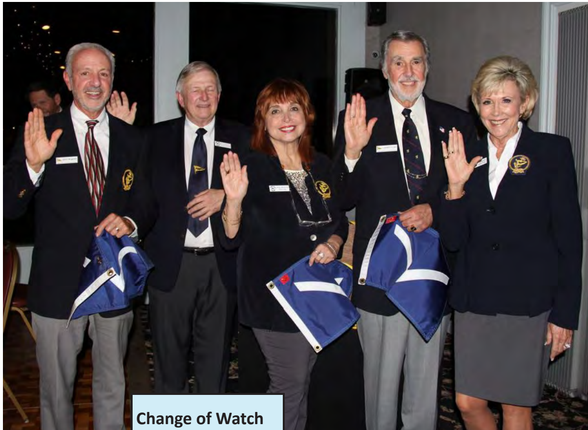
Change of Watch Jan. 13