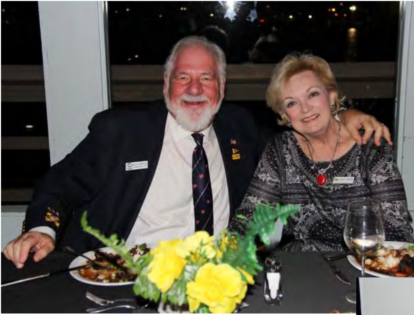
Change of Watch January 13 th