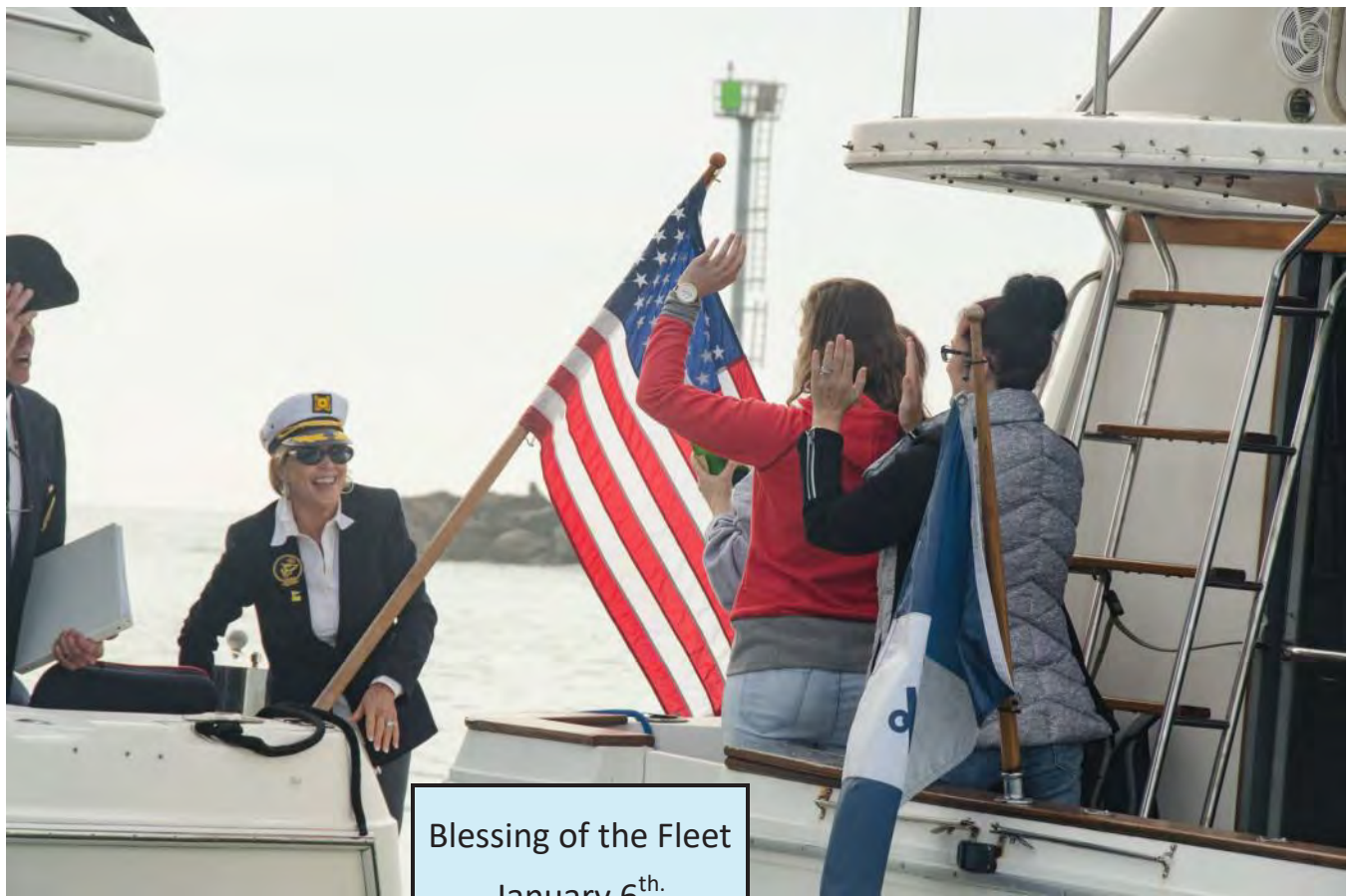
Blessing of the Fleet January 6 th .