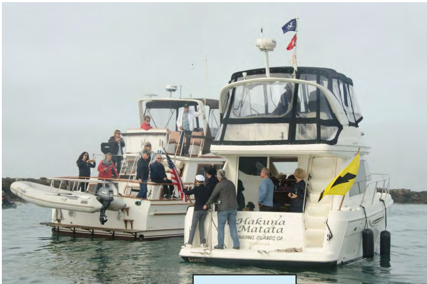
Blessing of the Fleet January 6 th .