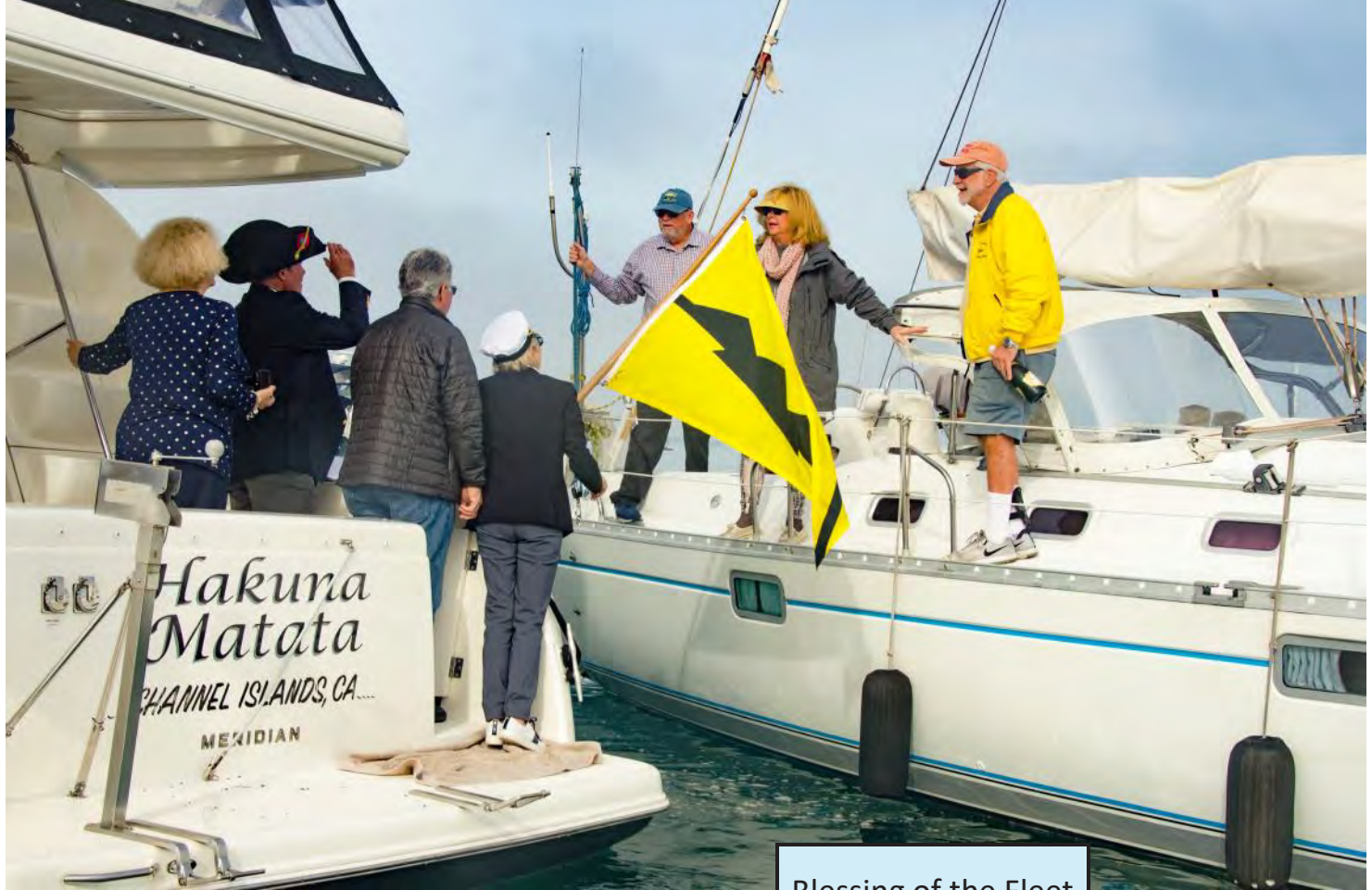
Blessing of the Fleet January 6 th .