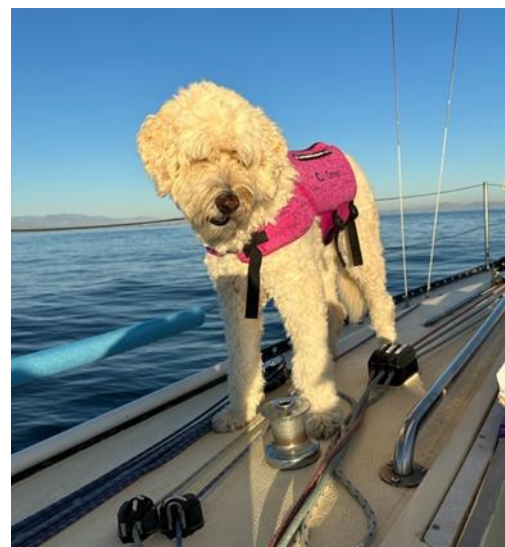
Doodle on deck