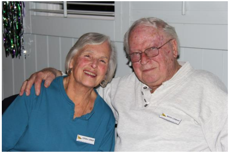
St. Patrick's Day Dinner/Social March 17 th