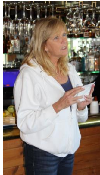
Whale Watch Cruise March 3 rd