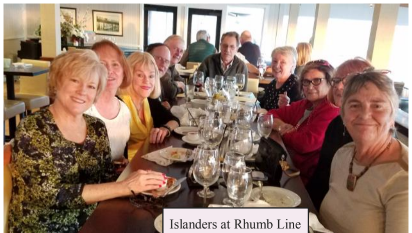
Islanders at Rhumb Line