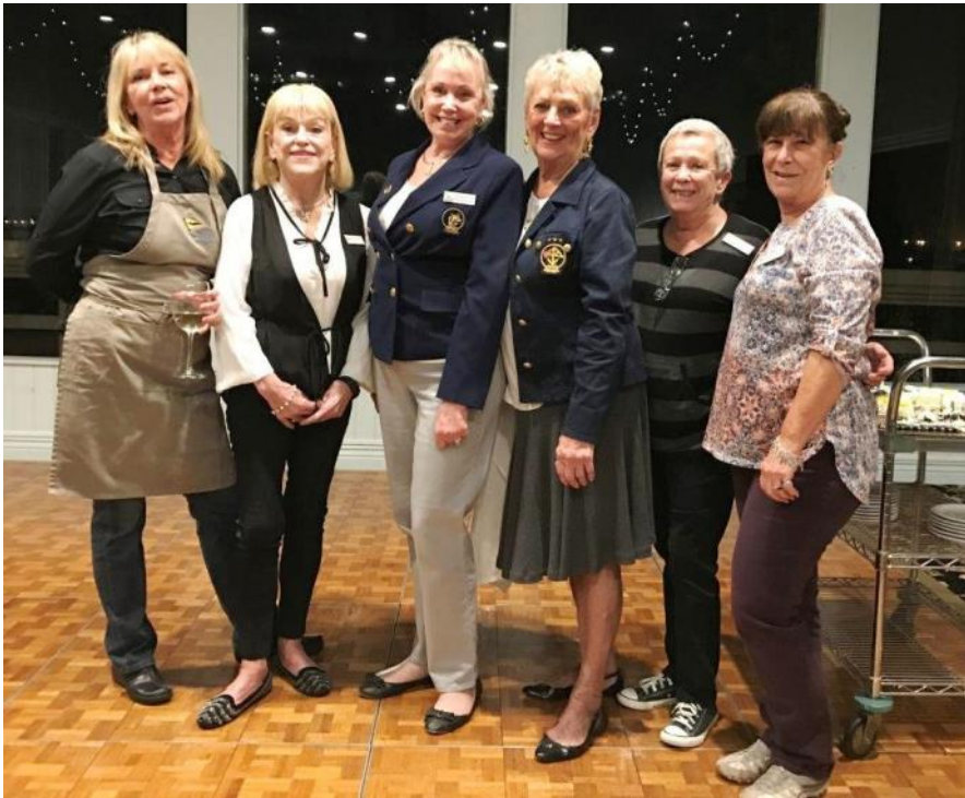
March 23 rd Cooking Crew