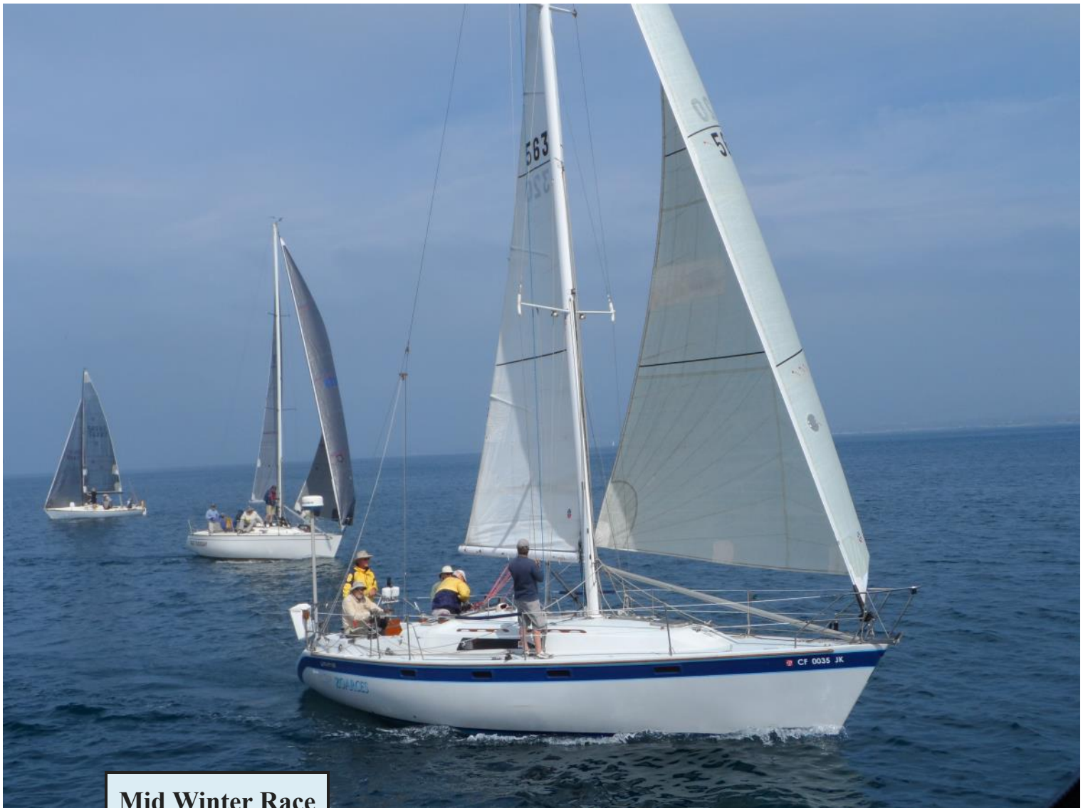
Mid Winter Race