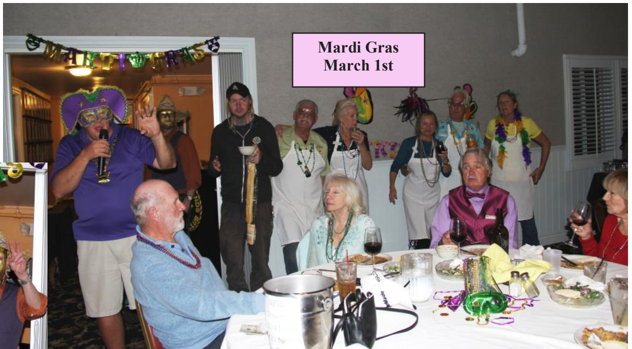
Mardi Gras March 1st