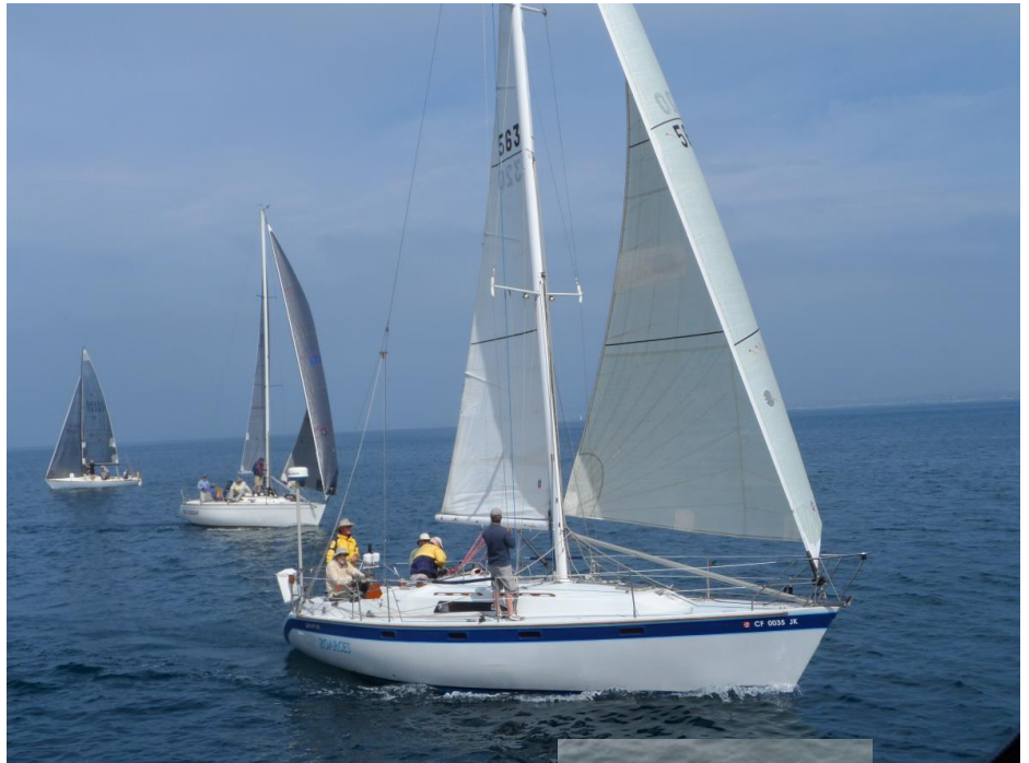
Mid Winter Race