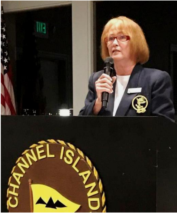
2016 - 2017 First Mate