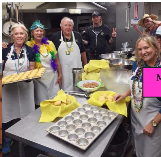
Mardi Gras March 1 st