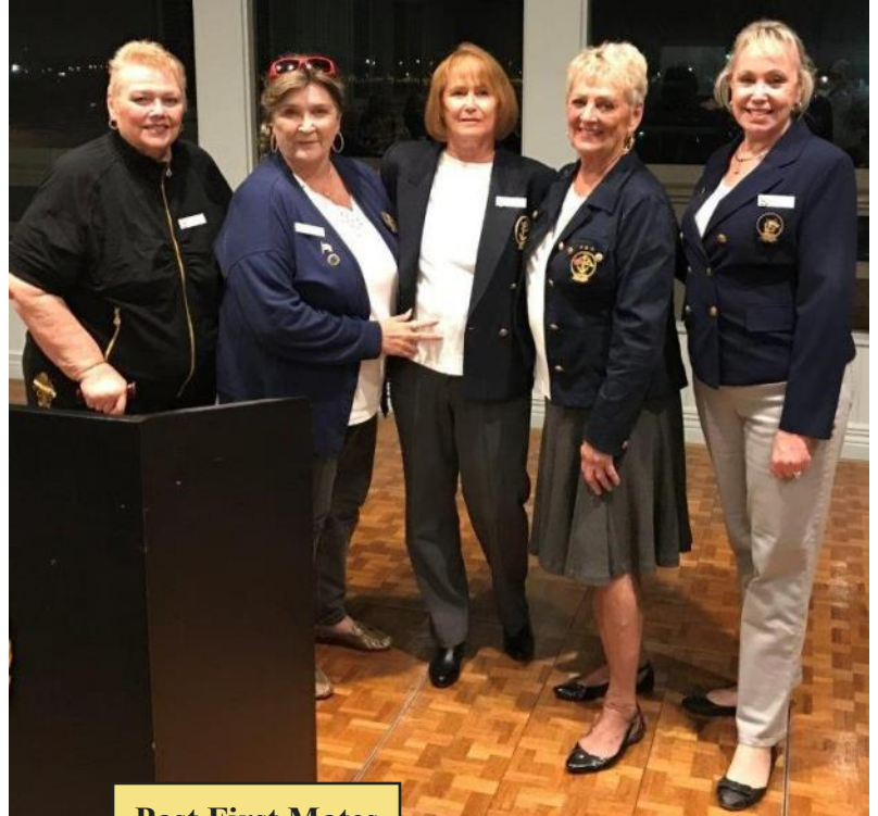
Past First Mates