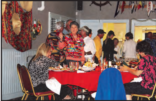
Cinco de Mayo Dinner/Social May 4 th