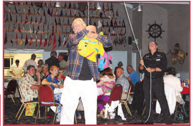
Cinco de Mayo Dinner/Social May 4 th