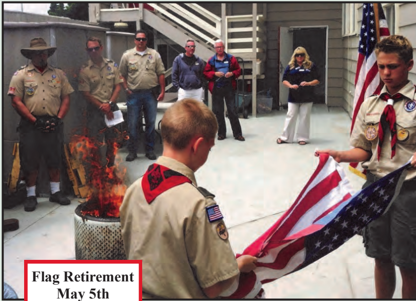
Flag Retirement May 5th

CIYC members have accumulated old and tattered American Flags , and don't know what to do with them.