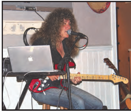
Entertainment by Theresa Russell!