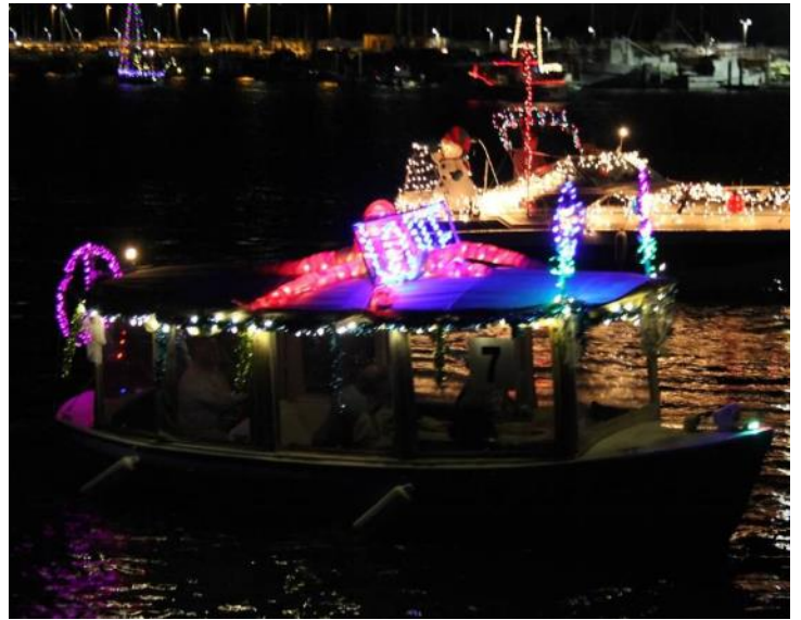
2015 Parade of Lights December 12 th