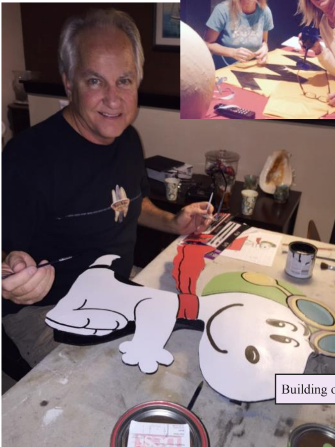
Building our float