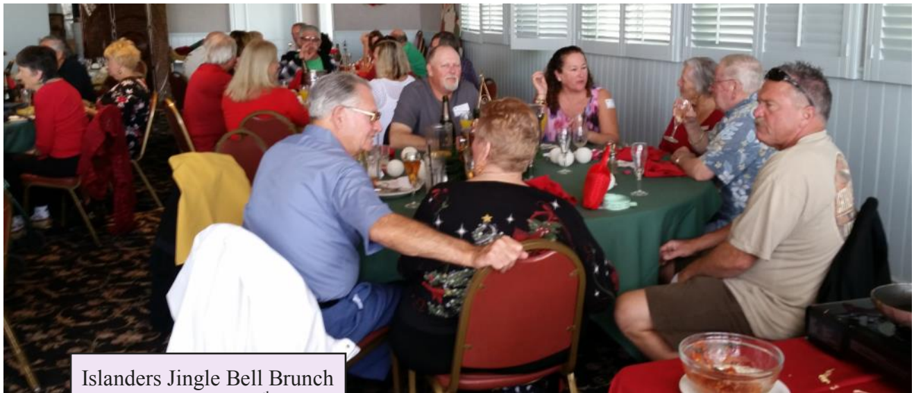
Islanders Jingle Bell Brunch December 12 th