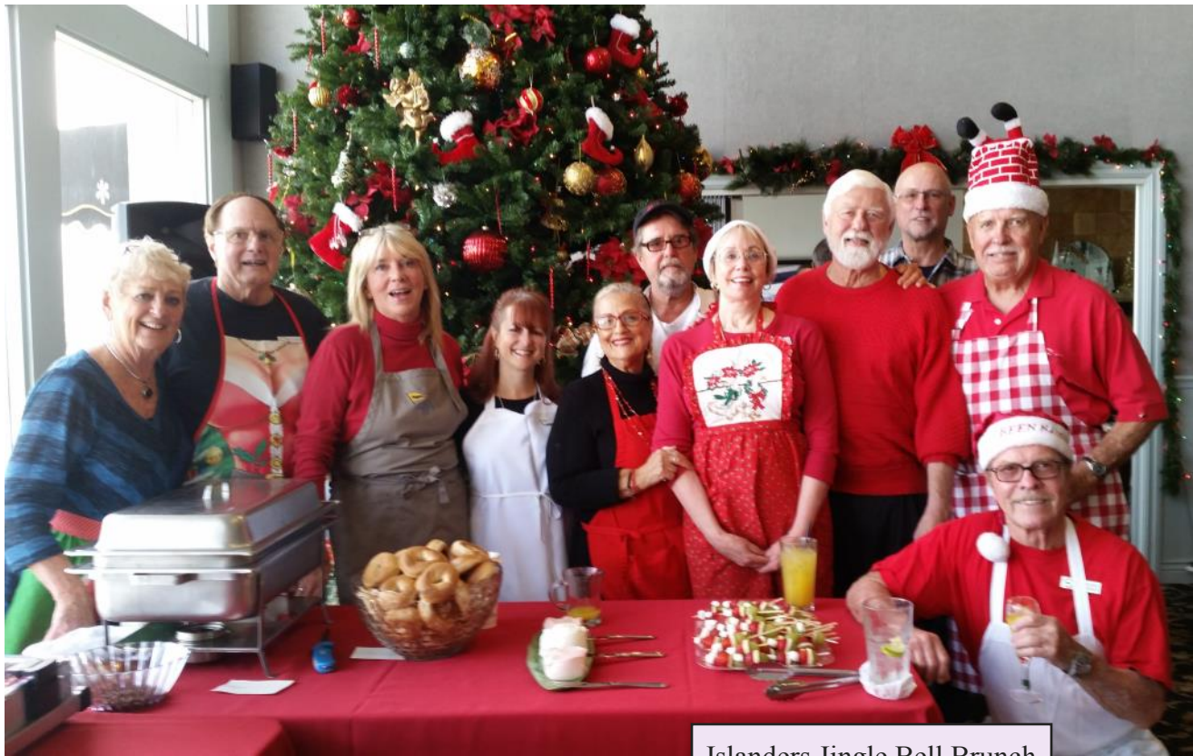
Islanders Jingle Bell Brunch December 12 th