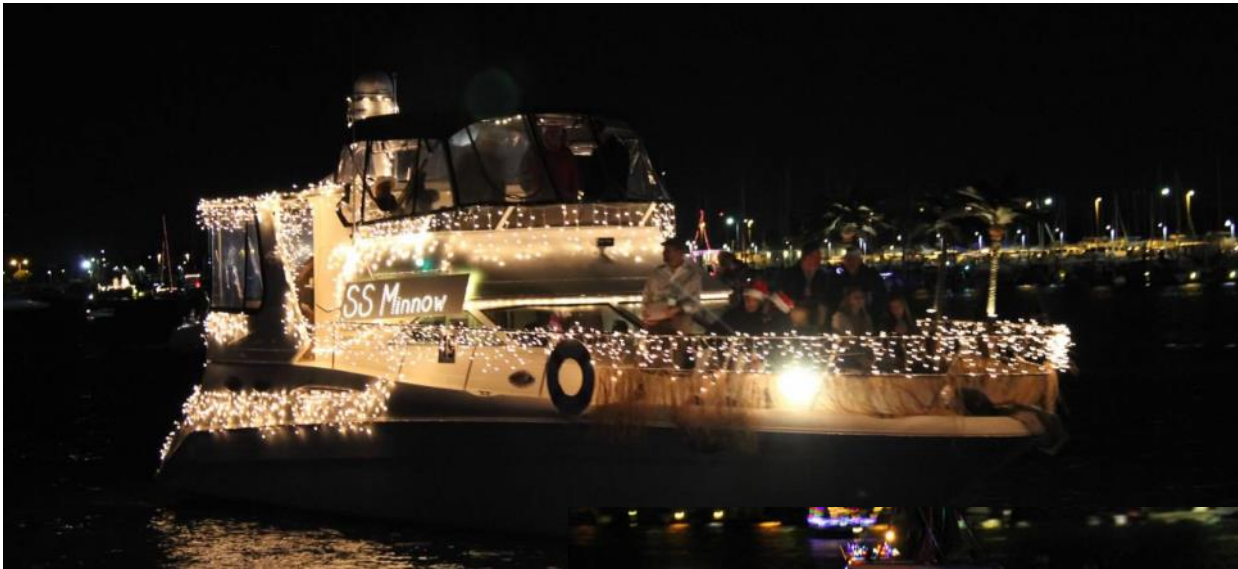
2015 Parade of Lights December 12 th