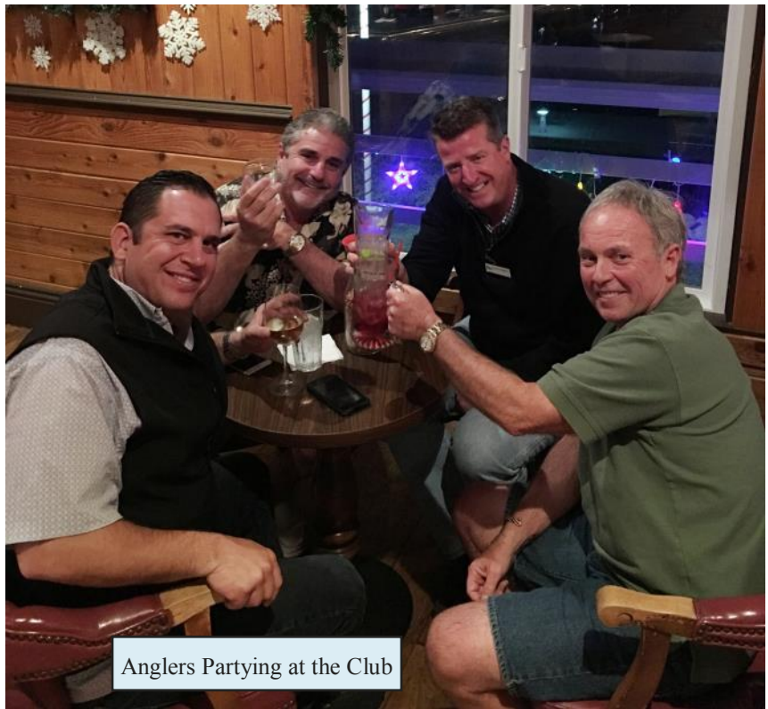
Anglers Partying at the Club