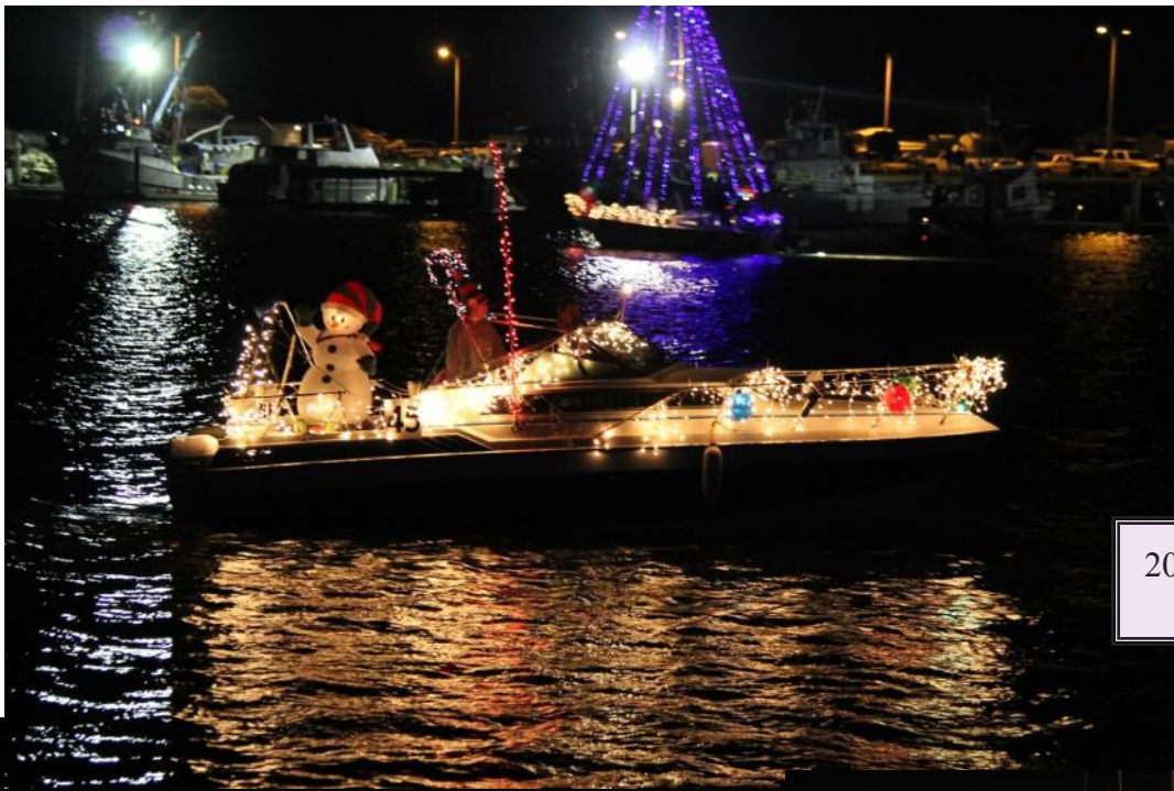
2015 Parade of Lights December 12 th