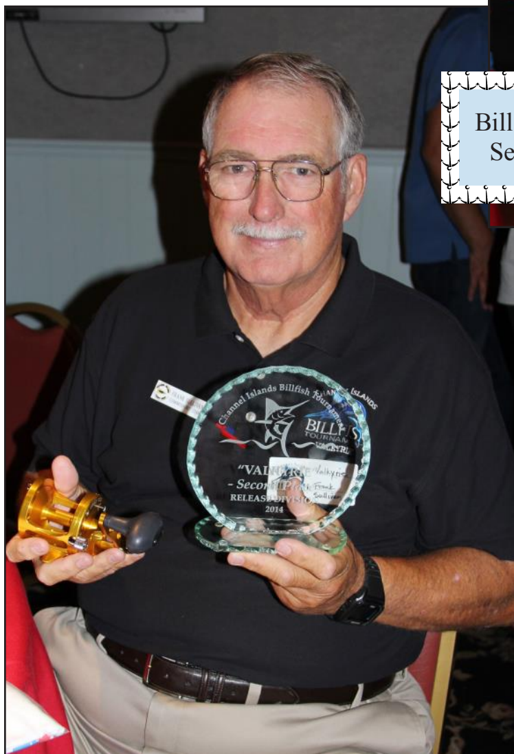
Bill Fish Awards September 19