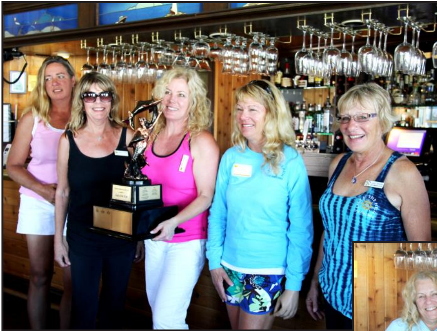
Lady at the Helm Race September 20