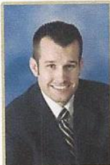
BRIAN NICOLAS SIPES

1500 PALMA DRIVE, SUITE 215, VENTURA, CA. 93003 PRMI NMLS #3094