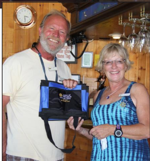
Lady at the Helm Race September 20